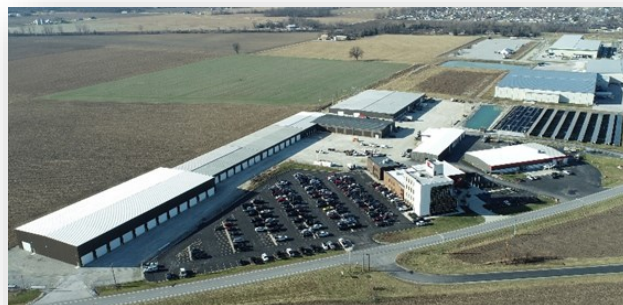
Vaughn Industries HQ Facility - Carey, OH

construction projects including healthcare, higher & lower education, industrial & manufacturing facilities, data centers, high voltage substations and transmission lines, and solar fields. These projects range in size from 2 days to 4 years, producing $220 million in annual revenue.