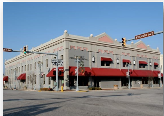
FCNB Main Office - Upper Sandusky, OH

to six connected buildings. The sixth building was fully renovated and is leased to a local retail business, enhancing downtown pedestrian traffic. Updates to the main office design and technology are currently underway to meet the current and future financial needs of customers.