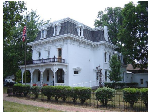
Wyandot County Historical Museum