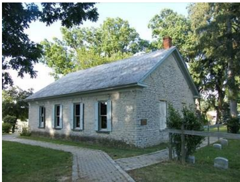
Old Mission Church