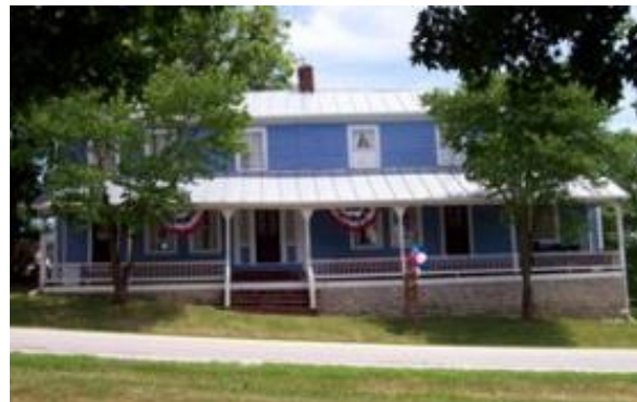
McCutchenville Overland Inn

Wyandot County is served by three historical societies: The Wyandot County Historical Society, the Carey Historical Society and the Mohawk Historical Society, and there is an active genealogical society, The Wyandot County Tracers, as well.