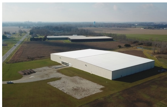
New 100,000SF Fostoria Location - Coming soon

In addition to the WOCED, Ohio Logistics is a member of economic development organizations in Hancock County, Wood County, Sandusky County, Putnam County, Allen County, Bowling Green, Fostoria, and Trenton, Ohio, as well as the Regional Growth Partnership.